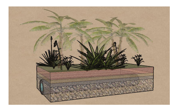
Figure 1 - Schematic drawing of an evapotranspiration tank.

It is also observed the need for reforestation of riparian vegetation, which will help to absorb the nutrients that are being leached into rivers. In the future, at some points where bioremediation will be applied, control the size of the trees by pruning will be needed, so there will not be shading over the water at these sites.