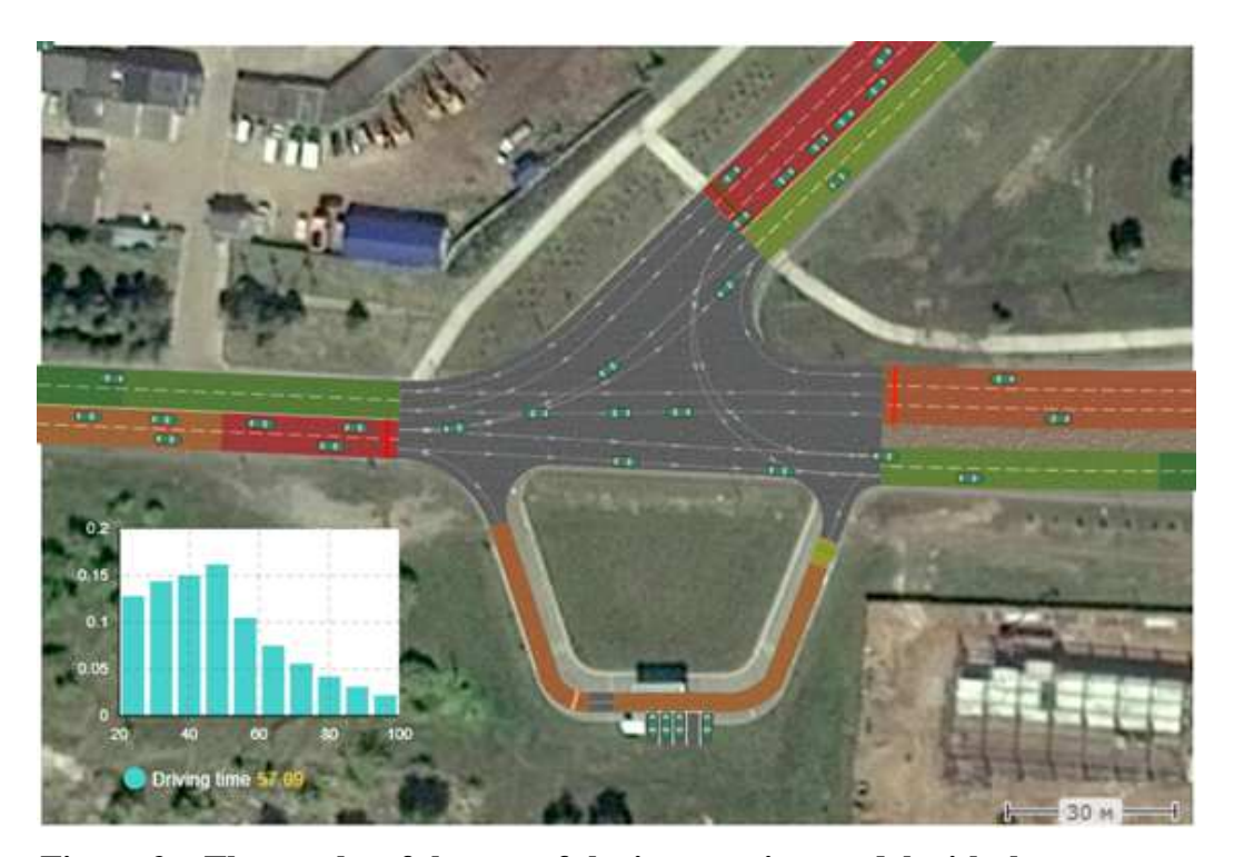
Figure 2 – The results of the test of the intersection model with the current parameters of the traffic lights

is above 60 km/h and red if it is below 10 km/h), it is useful to enable traffic jam display.