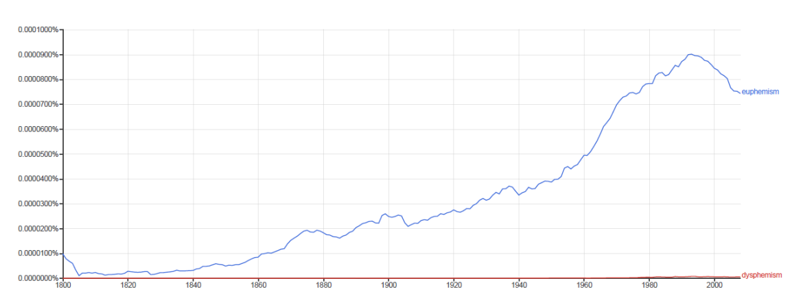
Figure 1. The trends in the use of "euphemism" and "dysphemism" according to the Google Books Ngram Viewer

Simple quantitative analysis of the use of these terms with Google Viewer Books Ngram shows disproportion between the numbers of occurrences (method section of this paper gives detailed description of the instrument used for the quantitative analysis). The graph below shows that there is significant difference between the trends in the use of two terms from 1800 to 2008 (Fig. 1). There was a steady increase in the number of euphemism occurrences that peeked after 1990 and fell slightly between 1994 and 2008. The use of the term "dysphemism" increased slightly after 1976 and remained at very low levels until 2008.