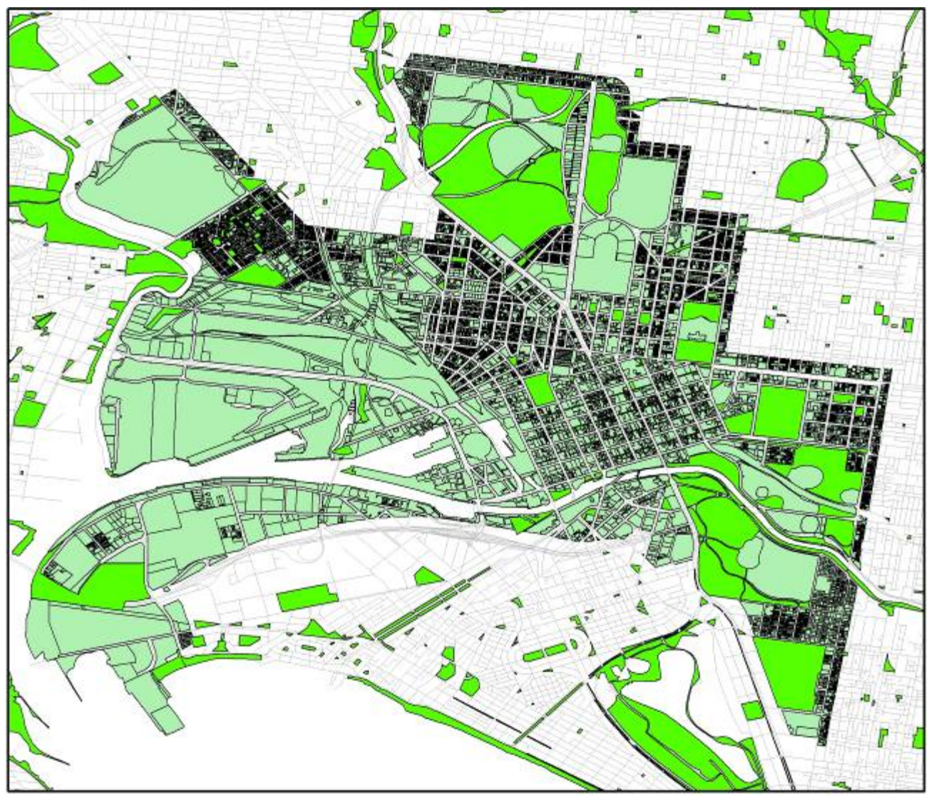
Fig. 1 Distribution of POS across the study area