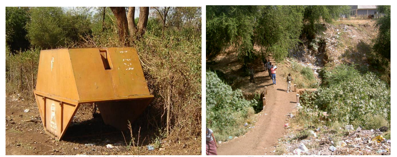
Fig. 2 Waste dumping sites of the town.

In the past the town administration has bought four storage bins for collecting solid wastes. At present these bins are full and have been emptied and turned upside down, not used. So residents litter waste around the bins causing serious health and environmental problems in the town. This serious problem calls for proper urban land use planning and management in the town.