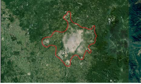
Fig. 1 Urban spot, 2014.