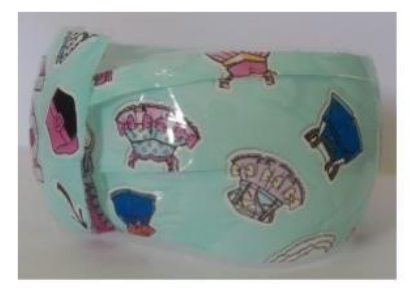
Figure 5 – Fifth layer