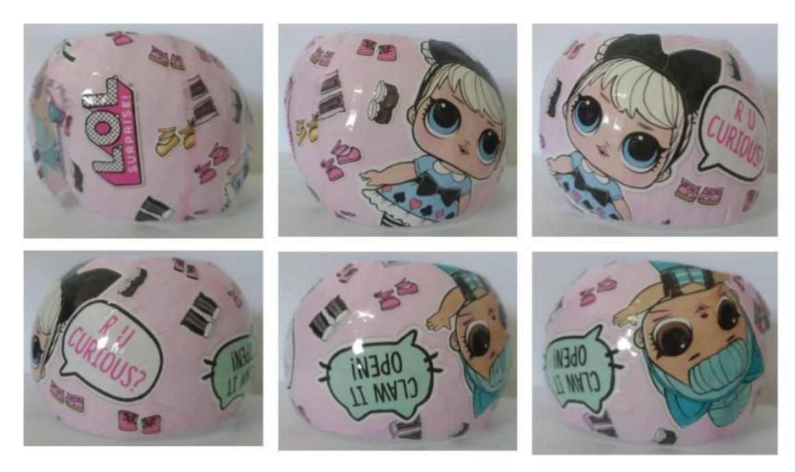
Figure 4 – Fourth layer