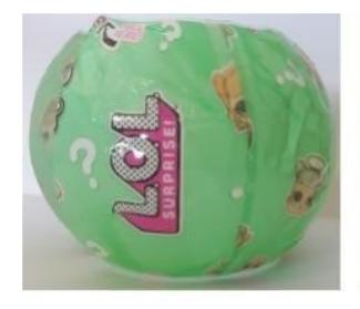
Figure 2 – Second layer

Even though the doll is not the central element of the layer, she can be considered the most important component through salience . She is foregrounded through size , and hair color which contrasts with the green background. At the same time, the dolls and the logo focus on the main object of desire to children, which is the L.O.L. Surprise doll. After peeling the first layer, the child<sup>6</sup> finds a secret message which should help him/her guess which doll is inside. The next layer (Figure 2) contains some information about the product. This layer has a different kind of representation when compared to the previous one and the subsequent ones, as it is possible to see in the following images.