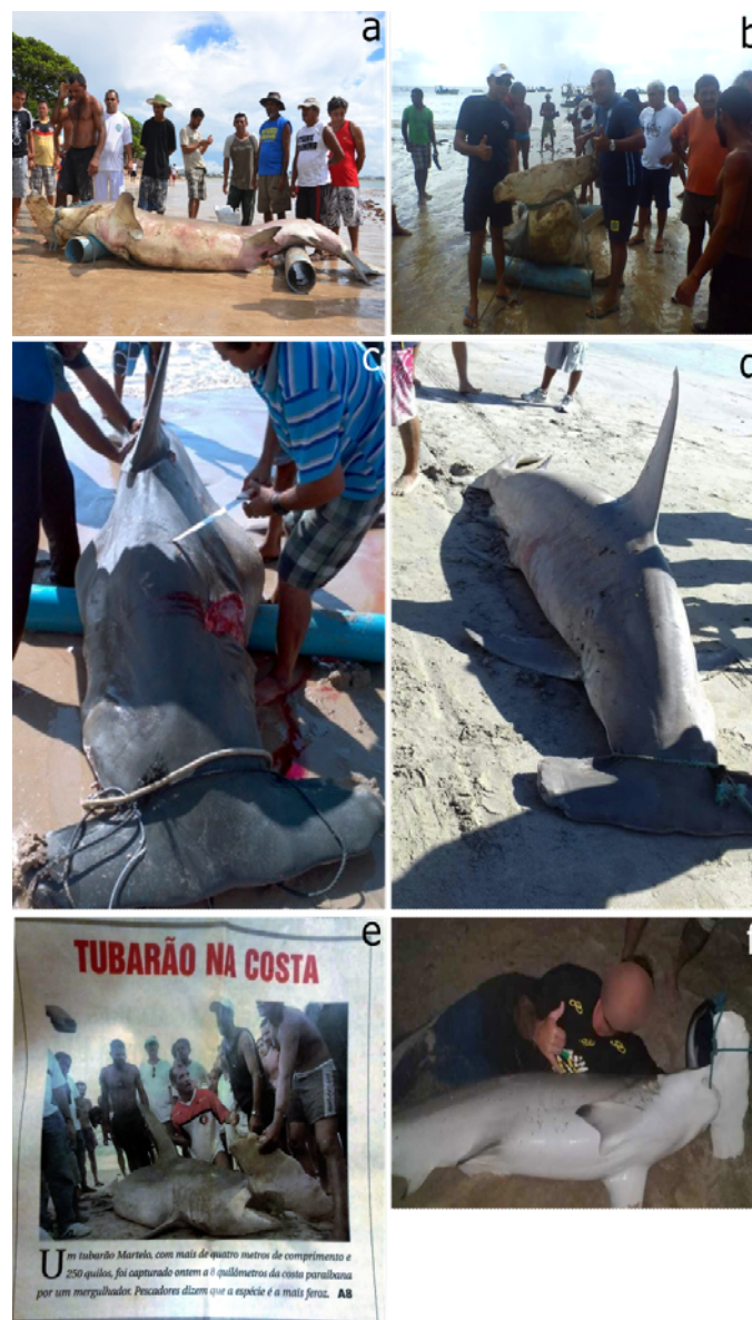
Figure 3. Pictures and media records of Great Hammerhead Sharks, Sphyrna mokarran , captured by fishers along the coast of Paraíba, Northeastern Brazil. (a, - source: Pesca Armadora, link: https://www.pescamadora.com.br/2013/06/tubarao-martelo-de-600-kg-e-capturado-em-jacuma/ ; b, - image courtesy of Alberto Sobreira; c, - image courtesy of Antonio de Padua de Moura; d, - source: ClickPB, link: https://www.clickpb.com.br/paraiba/pescador-captura-tubarao-martelo-na-praia-de-lucena-213775.html ; e, - image courtesy of Silvio Barreto; f, - source: PBAgora, link: https://www.pbagora.com.br/noticia/paraiba/tubarao-martelo-com-risco-de-extincao-e-capturado-no-litoral-sul-paraibano/ ).

Anecdotal records of S. mokarran in the state of Paraíba were previously based on either dead or captured individuals in poor physical condition. Between November 1997 and November 2016, local newspapers reported on a total of six adult specimens including two pregnant females with full-term embryos caught in August 2012 (Figure 3a-f; Appendix S1). Catch location information was lacking in these reports, preventing inferences on habitat and depth preferences of the sharks. It has been suggested that females of S. mokarran use coastal habitats as nursery areas in Brazil (Soto 2001), the fact that pregnant females were caught along the coast of Paraíba support this assumption.