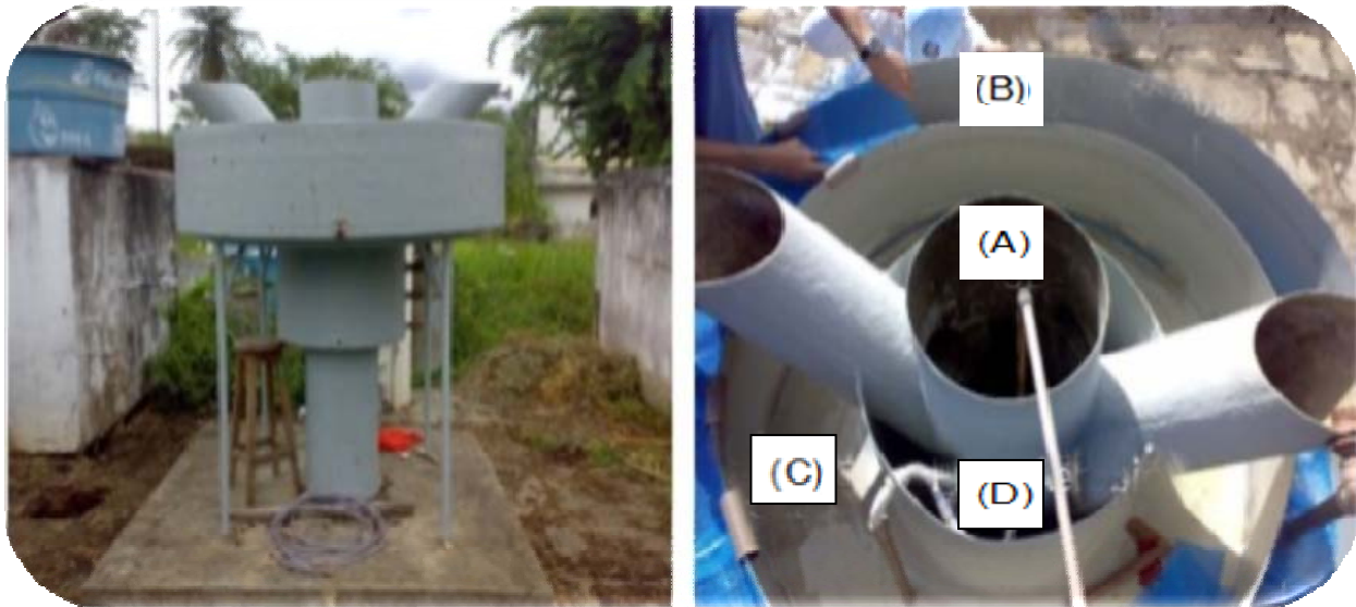
Fig. 2 Views of the single-family compact (SFC) station: A – upflow anaerobic sludge blanket reactor; B - anaerobic upflow bed filter; C – siphoning tank; D - aerobic intermittent sand filter.

W-type lateral separators inclined at 45°, an anaerobic upflow bed filter (UBF) with polyurethane hub filter bed, a flow transfer chamber and an aerobic ISF. The UBF was fitted with a 5 cm high false base made of a nylon screen for sludge accumulation, and a 20 cm high filter bed comprising 2 cm polyurethane cubes with 97% void volume (Sousa et al. , 2017).