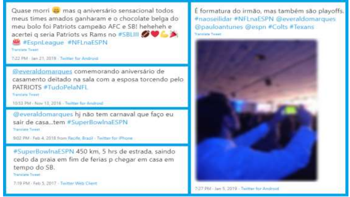
Figure 8. Key moments in the life of Brazilian NFL fans need to adapt to league games

Another identified aspect (code) regards how Brazilian NFL fans see league game days as an important appointment. They even change their week schedule and skip social events during the league season. Game days and schedules (i.e., Mondays and Thursday's nights and Sundays afternoons) are taken seriously, tweets report how Brazilian fans stop going to social events (e.g., birthday parties, family meetings) and even skip enjoying Brazilian summer Sundays and Carnival, which is the most emblematic festival of the Brazilian culture. Figure 8 brings tweets which can illustrate this aspect.