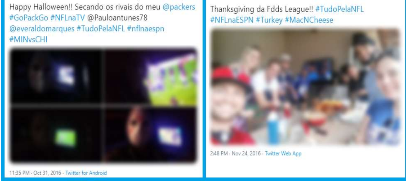
Figure 4. American holydays imported into NFL consumption

Thanksgiving, and all shows broadcast throughout this day, mention this celebration. Brazilian fans respond to the Halloween invitation by posting pictures in which they are wearing their costumes and by arguing that Thanksgiving should be a holiday in Brazil, so they could celebrate it and watch the games. Figure 4 shows tweets with photos of fans celebrating U.S. holidays while watching the NFL.