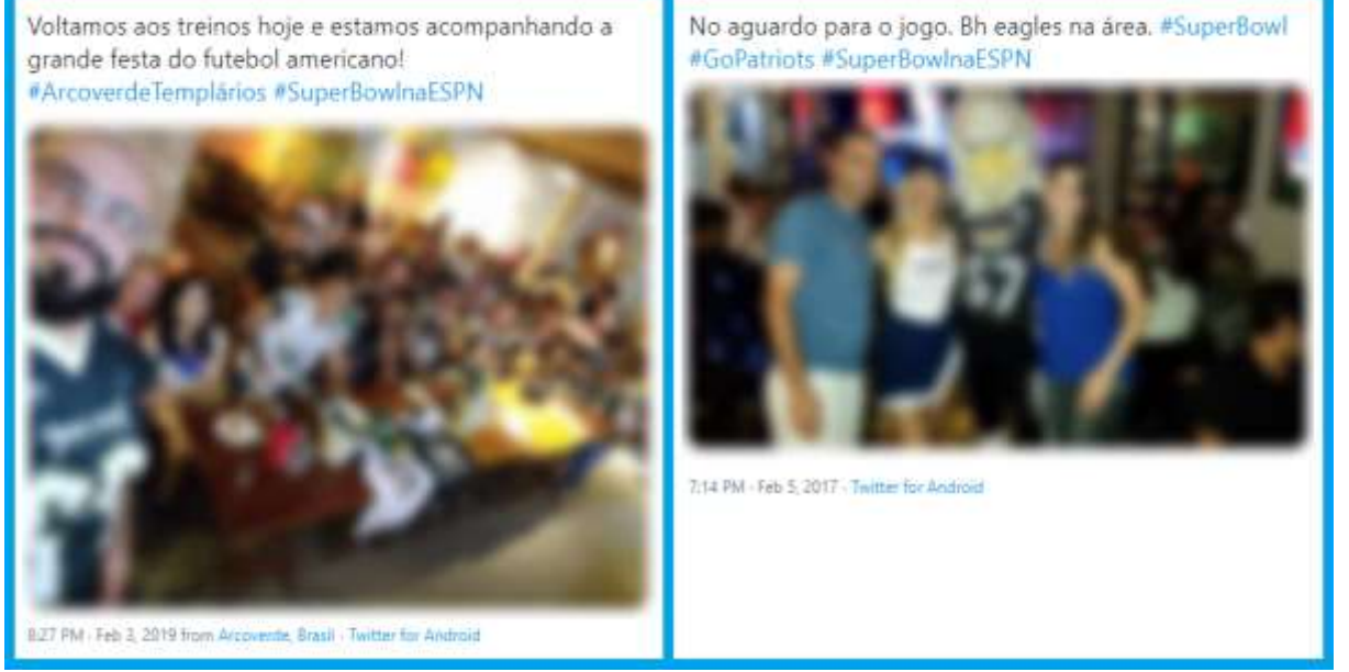
Figure 6. Super Bowl is consumed at NFL-related parties

drink and eat, during an event known as tailgate (Veri & Liberti, 2013). Supporters organize parties during the game, honoring the American flag, and counting on the presence of cheerleaders and team mascots in order to watch the games (Axelrod, 2001). The last code of this category highlights the parties organized by Brazilian NFL fans who watch the games together, mainly the Super Bowl, and who post pictures of great repercussion in the community. In order to follow the steps taken by native league fans, these parties have the tailgate vibration, honor the American flag and count on cheerleaders and team mascots, as seen in the tweets in Figure 6.