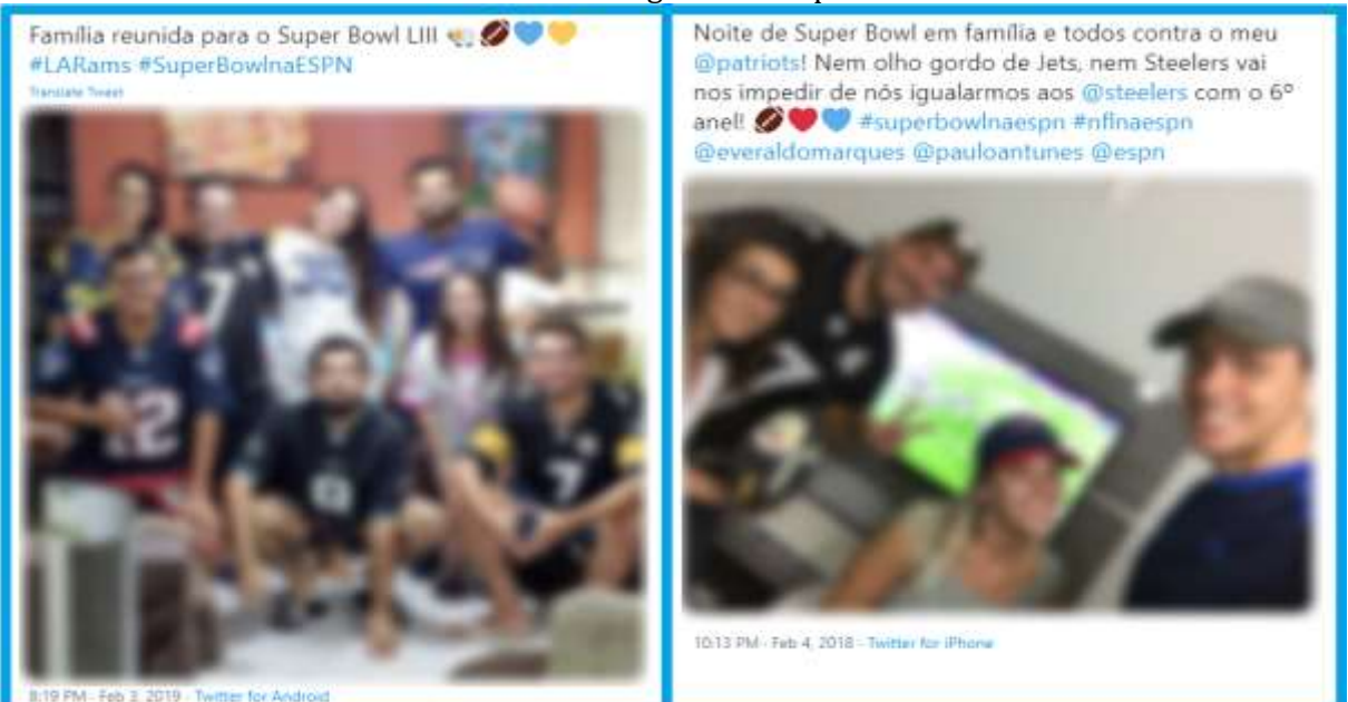
Figure 5. Super Bowl is already a family tradition for the Brazilian audience Source: research corpus , available from <u>https://twitter.com</u> (Accessed in May 21, 2020).