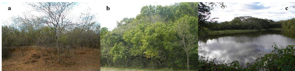
Figure 2. Sampled environments: a – shrub caatinga, b – arboreal caatinga, c – gallery forest.