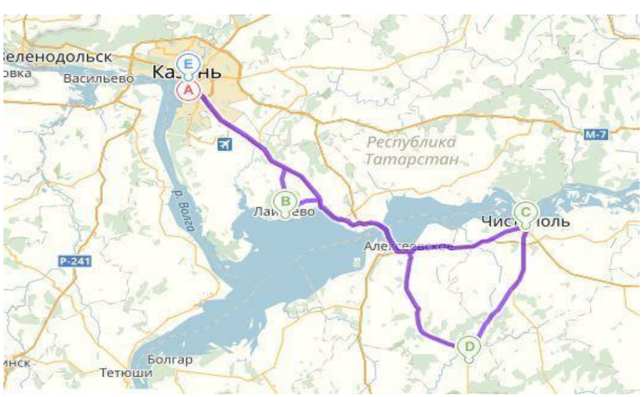
Fig. 2. Map of the route.

The target segments of the developed tourist product are high school students, young people and middle-aged people. Segment determined by the specifics of the route.