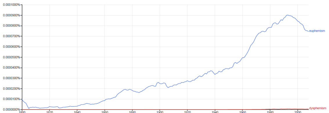
Figure 1. The trends in the use of “euphemism” and “dysphemism” according to the Google Books Ngram Viewer

Simple quantitative analysis of the use of these terms with Google Books Ngram Viewer shows disproportion between the numbers of occurrences (method section of this paper gives detailed description of the instrument used for the quantitative analysis). The graph below shows that there is significant difference between the trends in the use of two terms from 1800 to 2008 (Fig. 1). There was a steady increase in the number of euphemism occurrences that peaked after 1990 and fell slightly between 1994 and 2008. The use of the term “dysphemism” increased slightly after 1976 and remained at very low levels until 2008.