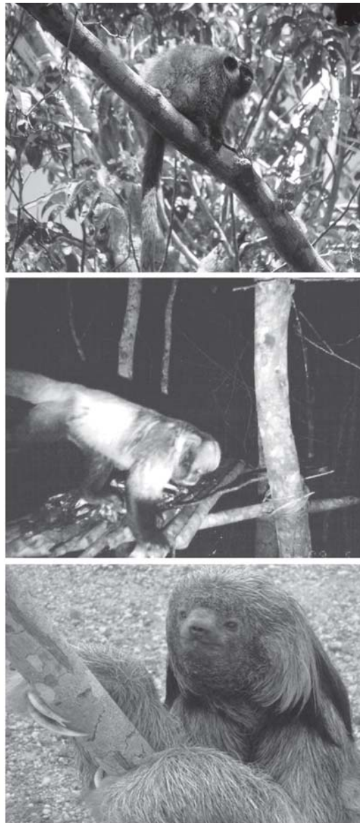
Figure 2 - Arboreal mammals observed at the Fazenda Trapsa, Sergipe: Callicebus coimbrai (A), Cebus xanthosternos , (B) and Bradypus torquatus (C).