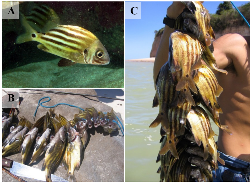
Figure 2. Individuals of Anisotremus moricandi caught by a local fisherman using harpoon, Cabo Branco Beach, João Pessoa, Paraíba, Brazil.