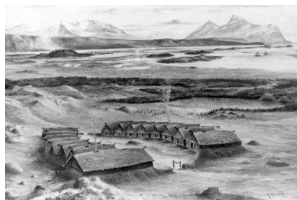
Figure 1 Artistic rendering of the courtyard site at Vollmoen, Steigen. After a painting by A. Reinert. See Storli 2010: 129.

This article is an attempt to find localization factors in the form of common features among toponyms as well as placement in the physical landscapes. In other words, to discuss the basis for a unified predicative model , as it were. A partial research question is whether it is possible to deduce something about function and localities from toponyms alone, be it among other things centrality, or whether they can be linked to maritime aspects such as the Leidang , the coastal system of proto-conscription and mobilisation, and the partition of the country into skipreider (ship districts), or proximity to sailing and trade routes. Any differences in time and space, i.e. dating, floor plans and geographical locations will also be discussed to glean possible geographical differences.