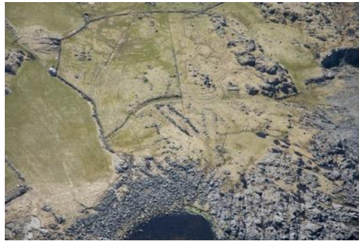
Figure 12 Boathouses at Ferkingstad. In aerial photography and in LiDAR, at least two foundations are visible.

in the Askeladen database as boathouse locality, demonstrates the uncertainty pertaining to interpreting sites. It is not impossible, thus, that some of the irregular courtyard sites were in fact boathouses for smaller vessels.