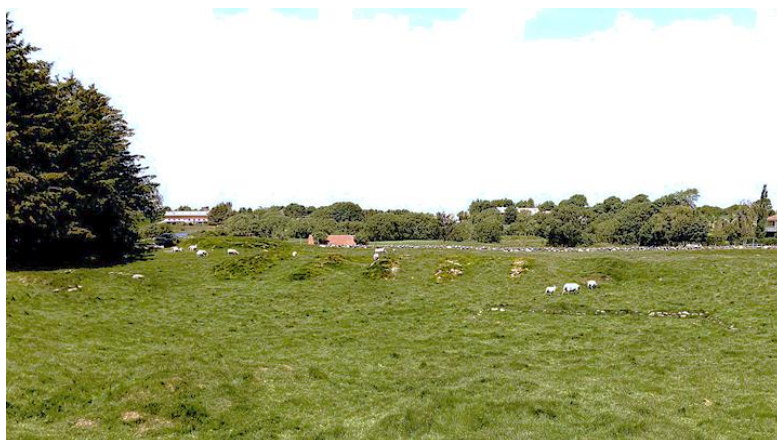
Figure 8 The site of Klauhauane.