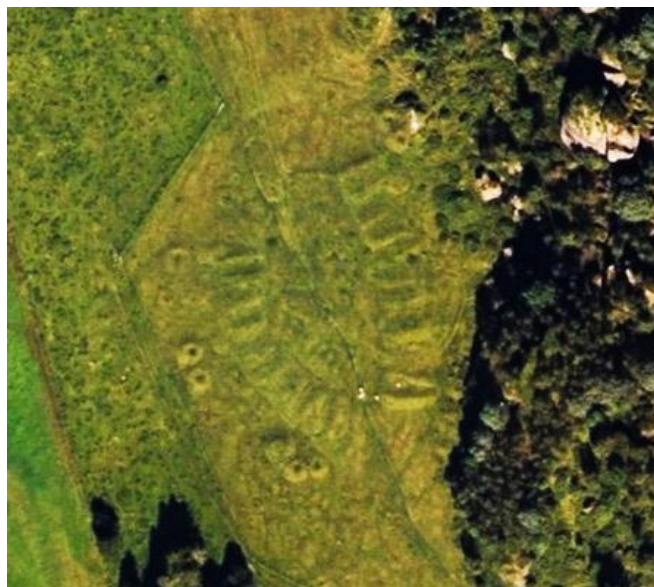
Figure 6 The site at Vollmoen.