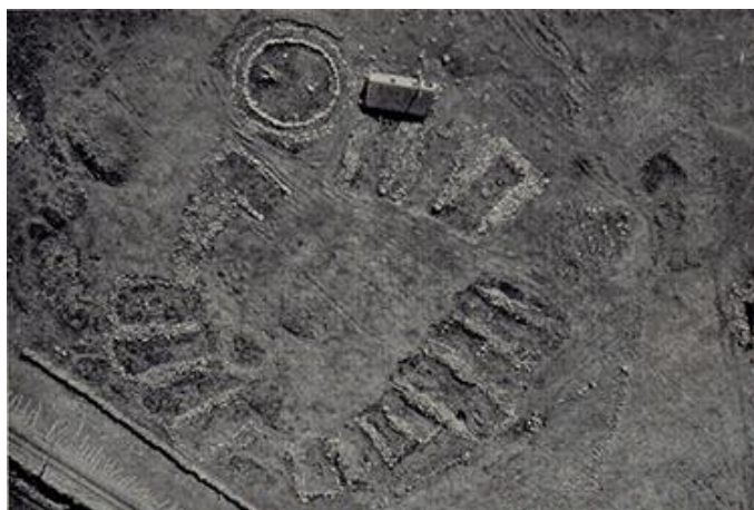
Figure 9 The site at Varhaug.

The site is highly visible with an oval to circular floor plan consisting of 15 larger house foundations. In connection with the site are also found several burial mounds and cairns, one of which is almost integrated into the courtyard site. There are several large burial fields in the immediate area.