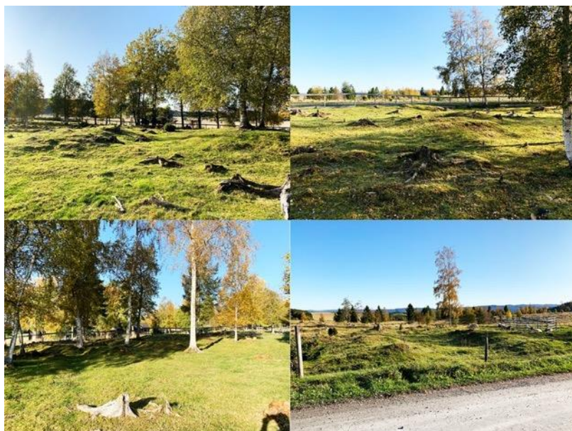
Figure 10 The courtyard site at Skei.