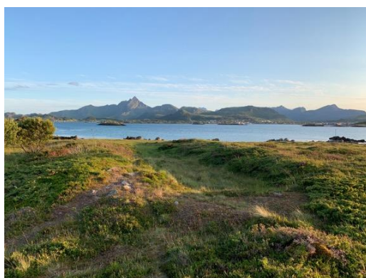
Figure 5 The large boathouse at Leknes.

Given the location, the site at Leknes would have been accessible by sailing vessels as well as being centrally located in connection with the shipping lane, attested by the presence of boathouse and moorings (Fredriksen 2019: 103). At Leknes is found, among other things, the large boathouse at Kuholmshaugen (id. 47548-1, figure 5) which measures 520m 2 (13m x 40 m).