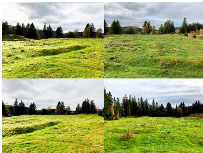
Figure 11 The courtyard site at Værem.