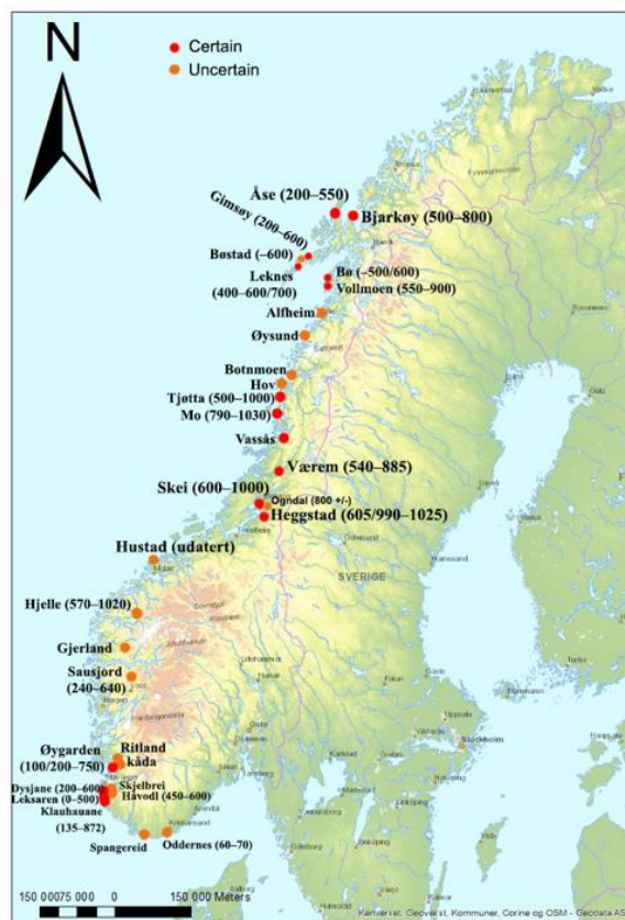
Figure 2 Map of known and assumed courtyard sites. Map made in ArcMap 10.7 by Are Skarstein Kolberg. Map data from Kartverket.